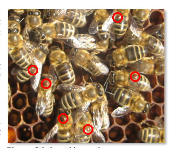
Figure 2 Infested honey bees

Identification of honey bee populations resistant to V. destructor is of particular interest for the SMARTBEES project. Thus, a specific approach should be used for monitoring and control of the mite in at least one full annual cycle. During the summer period the test colonies should be checked for the infestation of bees (Fig. 2) on a monthly basis in order to identify resistant colonies whose infestation levels remain below certain thresholds. Consequently, the identified test colonies will be wintered without therapeutic treatment against Varroa. The successfully overwintered colonies, which reach the next season in healthy condition, will preferentially be selected for the further breeding process.