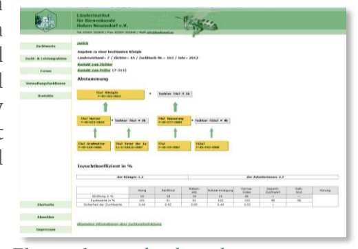
Figure 6

testing of different groups of sister queens in various test stations. Additionally, the estimation includes information on the queen pedigree and performance data from the ancestors and genetically related individuals (Fig. 6). The registry and ranking list of the tested queens is transparent and visible for any honey bee breeder and beekeeper.