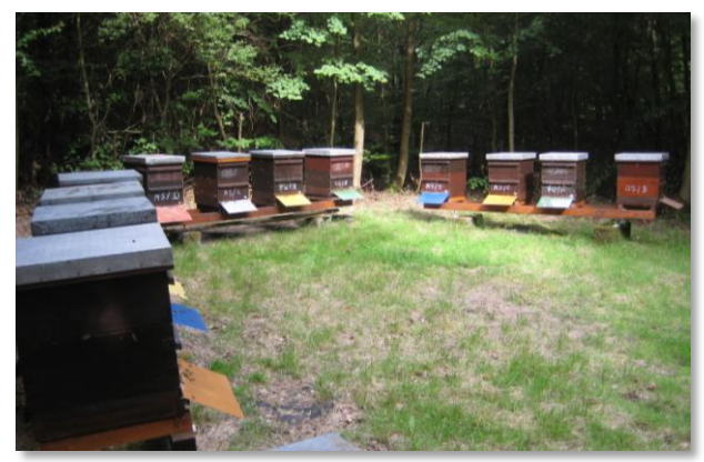
Figure 1 An example testing apiary

Random orientation of the hives' entrances and their different coloration additionally will improve the objectivity and will reduce drifting (Fig. 1).